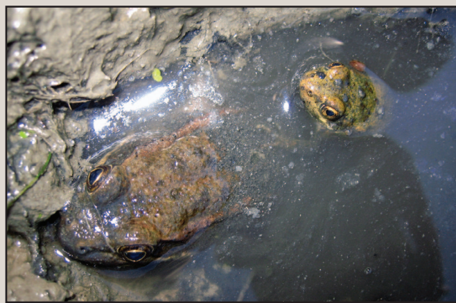
FIG. 2. Two size cohorts (frog on right is approx. 25 mm; frog on left is approx. 50 mm) of Rana draytonii , with the larger cannibalizing the smaller shortly after the photo was taken.

both pre- and post-metamorphic R. draytonii and are taken by cannibalistic feeding. This cannibalism likely is opportunistic and provides a seasonally abundant source of protein for larvae and post-metamorphic frogs.