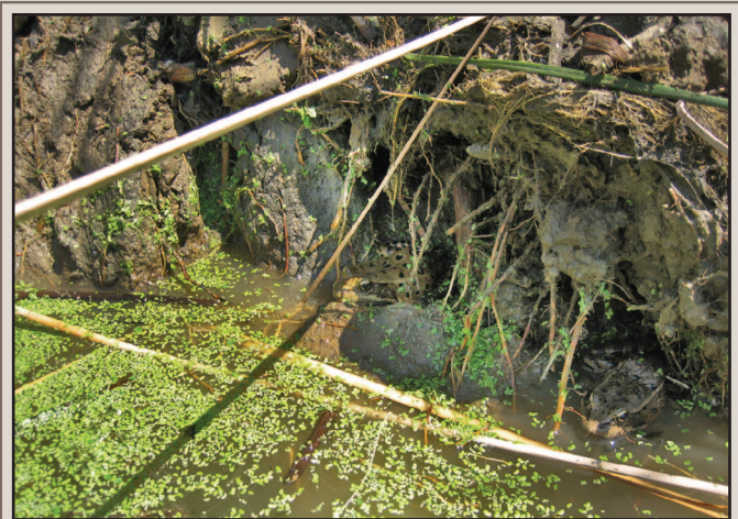
FIG. 1. Two adult Rana draytonii well-hidden within a beaver dam that was being removed along Kellogg Creek, Contra Costa Co., California.

It is clear that the infrastructure—both dams and burrows associated with bank-lodges—resulting from beaver activity provides refuge microhabitat for R. draytonii . Beaver-dammed water bodies also provide breeding habitat for R. draytonii adults and rearing habitat for tadpoles. These sites should be treated as critical to the survival of local populations of this species;