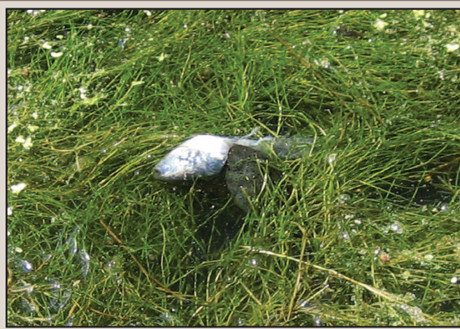
FIG. 1. A larval Rana draytonii cannibalizing a conspecific at the surface of a stock pond.