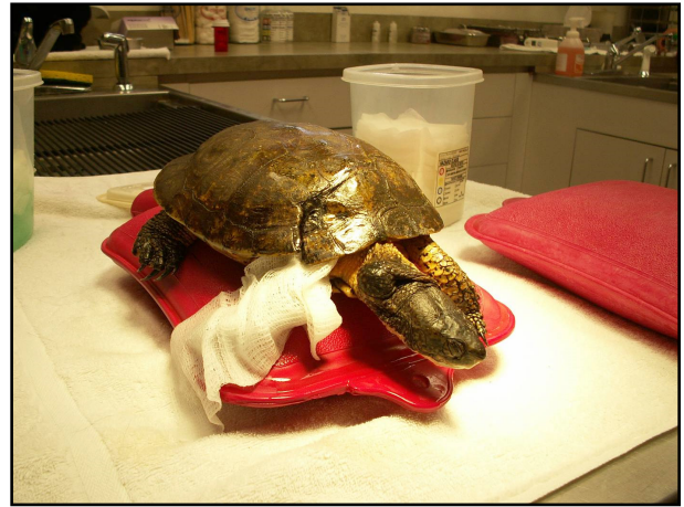
FIGURE 2. Adult Southwestern Pond Turtle ( Actinemys pallida ) struck by rotary-disc lawn mower in Moorhen Marsh, California. The anterior portion of the carapace was dislocated, with additional injuries sustained during the incident (the turtle is under sedation). (Photographed by Louisa Asseo).

2013). During an annual spring trapping event in 2013, we found a severely injured pond turtle. Its carapace was completely broken from a slicing-type injury above the left forelimb and across to the right forelimb, and was displaced anterior to the original position. The fractured carapace rubbed against the right forelimb, causing raw abrasion (Fig. 2). Additionally, a previously incurred, entrenched bacterial abscess had formed on the neck of the turtle just posterior to the head. The turtle was immediately delivered to a veterinarian specializing in reptiles (Louisa Asseo), where it was sedated, the abscess was surgically removed, and the carapace edge was filed to reduce abrasion to the right forelimb (Fig. 3).