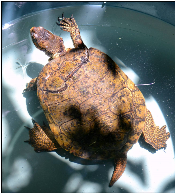
FIGURE 4. Adult Southwestern Pond Turtle ( Actinemys pallida) 15 d after surgery, tumor removal, and carapace filing following mower injury at Moorhen Marsh, Martinez, California. The turtle was released following being photographed.