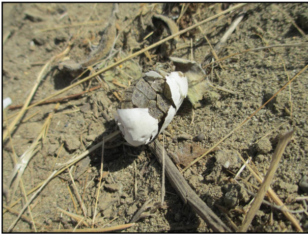
FIGURE 1. Southwestern Pond Turtle ( Actinemys pallida ) near-hatchling after being struck by a rotary disc mower along the Pajaro River in Santa Cruz County, California. The nest and the remainder of hatchlings were predated by unidentified mesocarnivores following the mower strike.